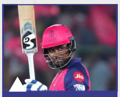
Sanju Samson celebrated 10 years at the Royals and achieved the milestone of captaining 50 IPL matches