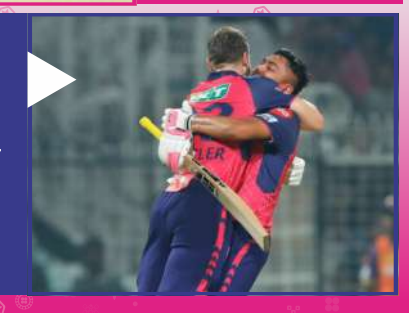
Against KKR, the Royals chased down 224 runs and set a new record for the team's highest successful run chase in IPL history