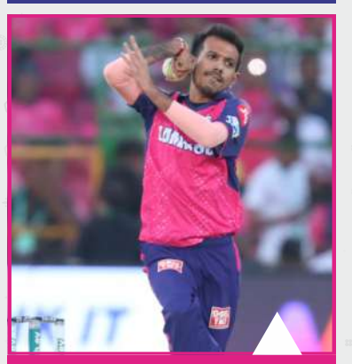
Yuzvendra Chahal became the first bowler in IPL history to take 200 wickets